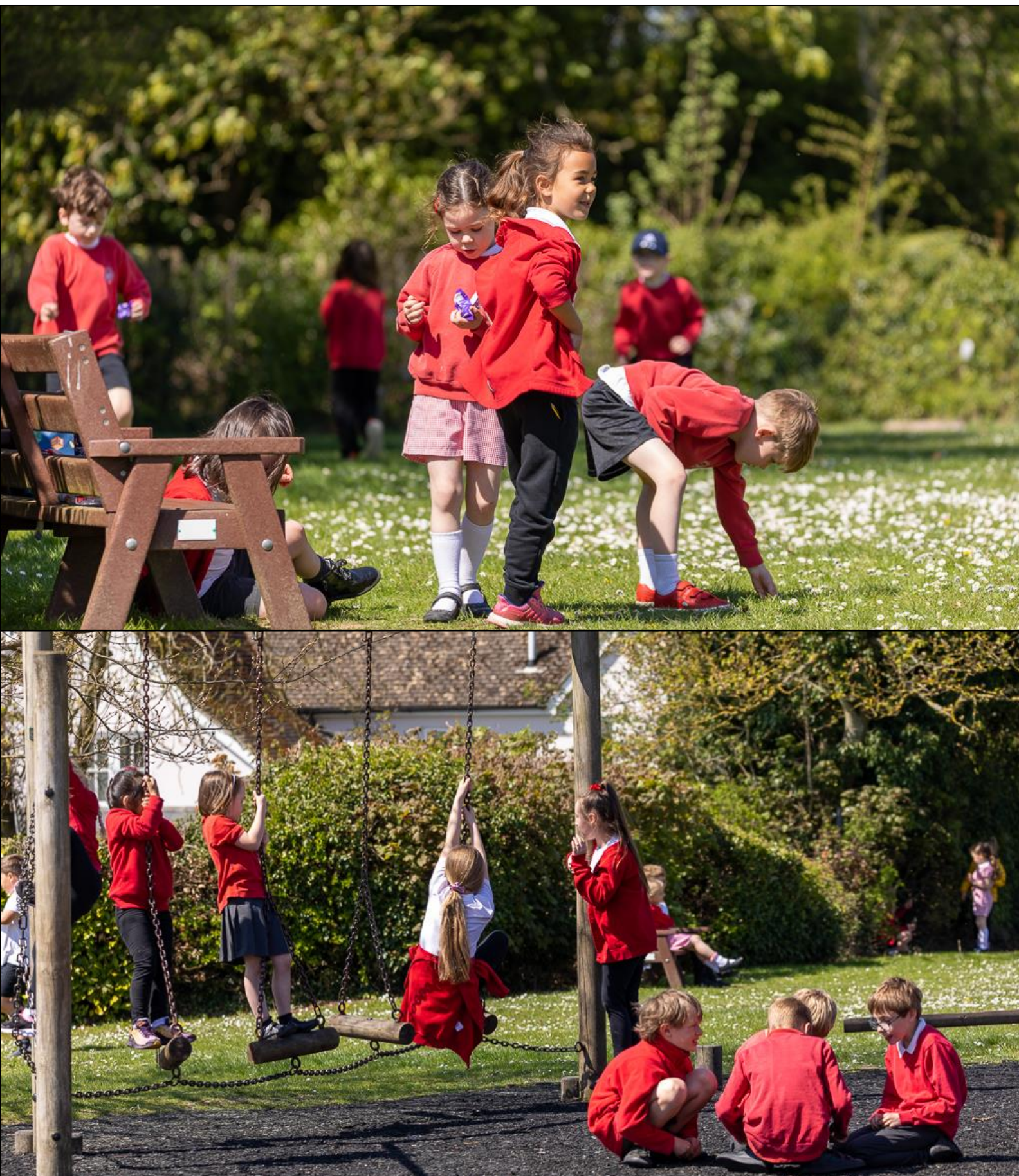
SCHOOL PROSPECTUS 2022-23