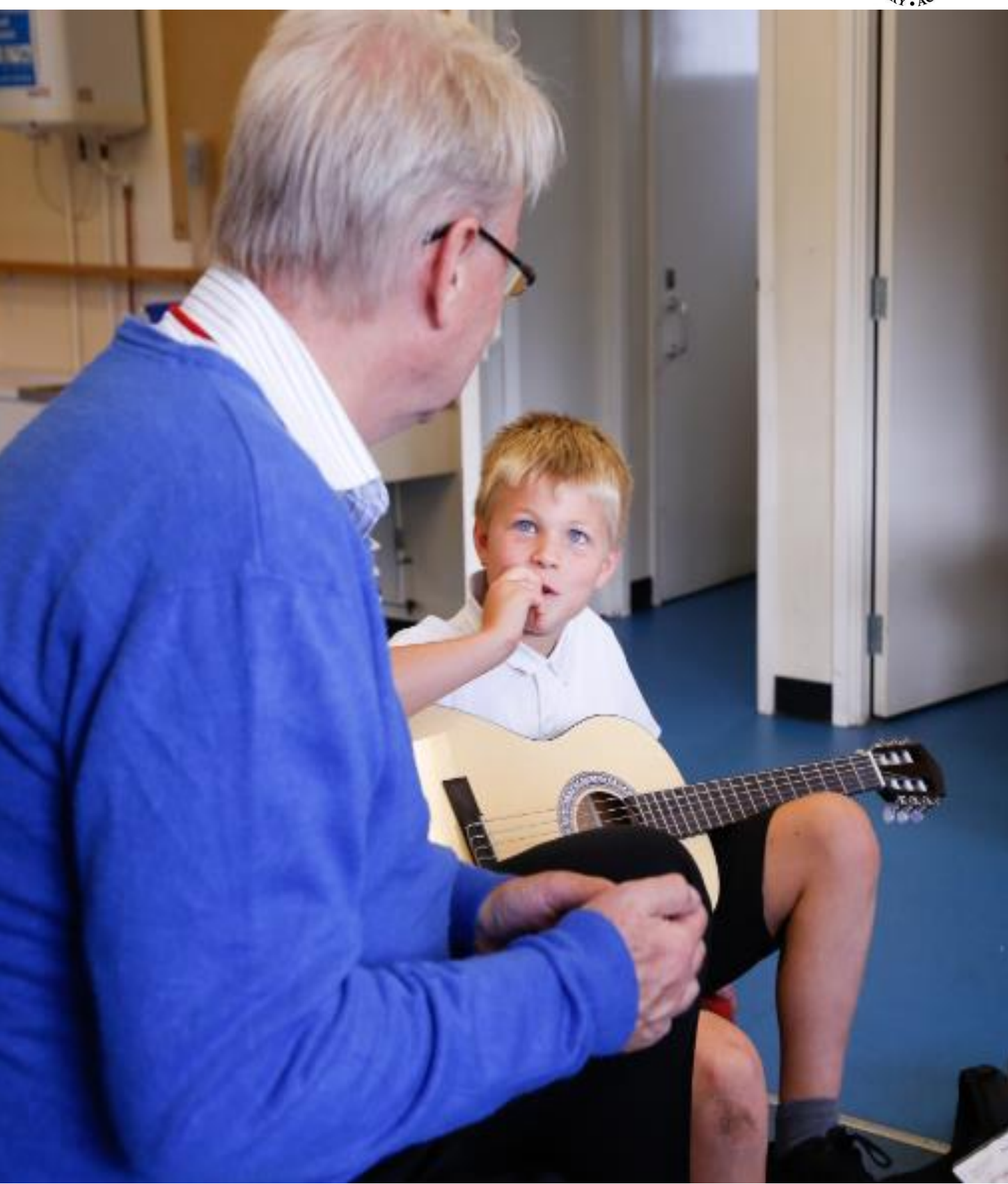
SCHOOL PROSPECTUS 2023-24