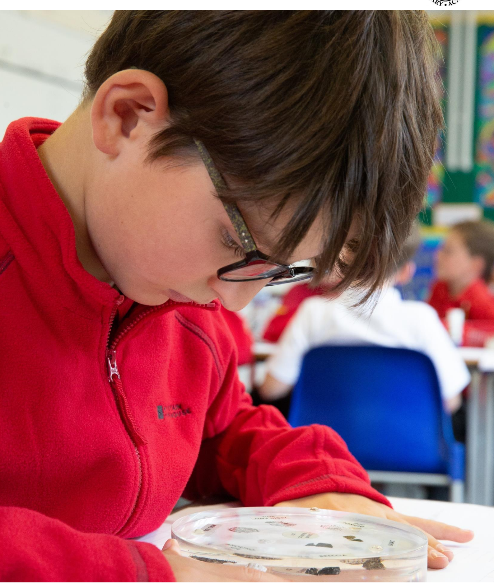
SCHOOL PROSPECTUS 2023-24