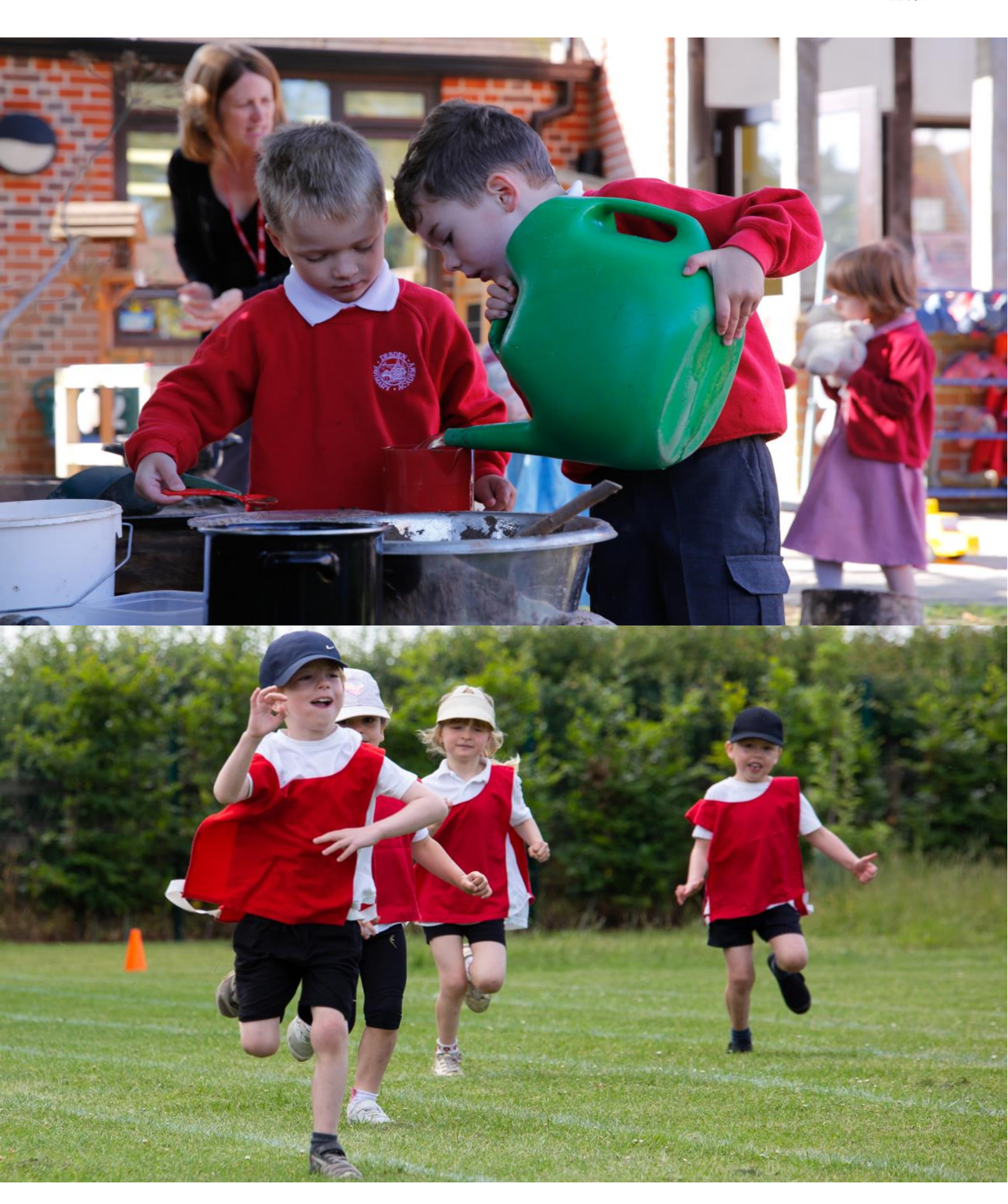
SCHOOL PROSPECTUS 2023-24