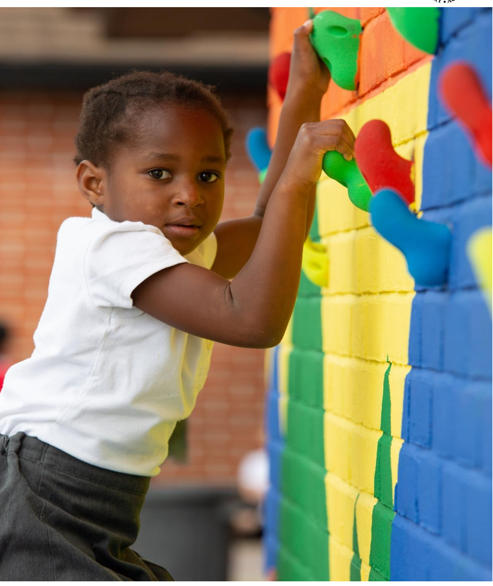
SCHOOL PROSPECTUS 2023-24