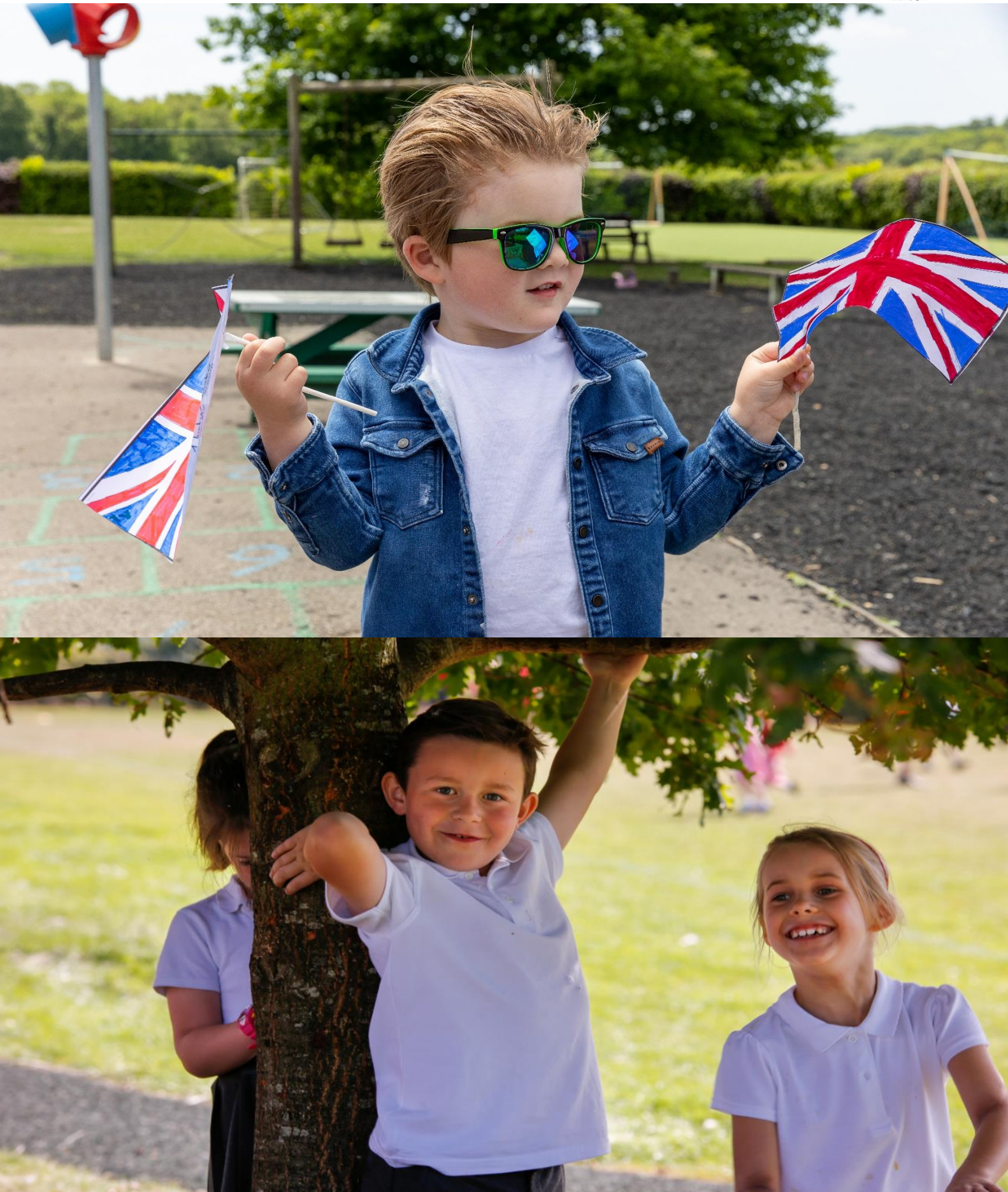
SCHOOL PROSPECTUS 2023-24