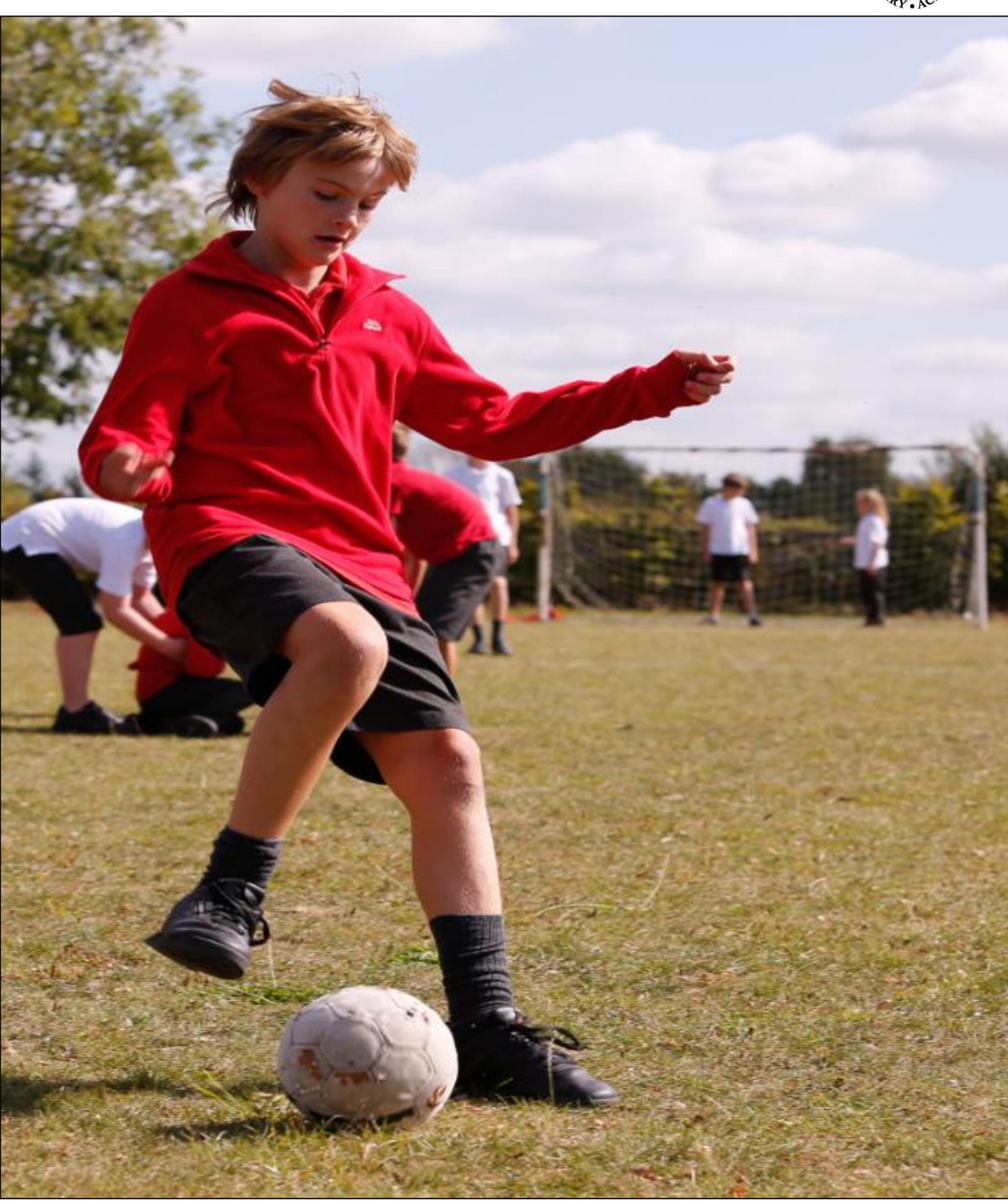
SCHOOL PROSPECTUS 2023-24