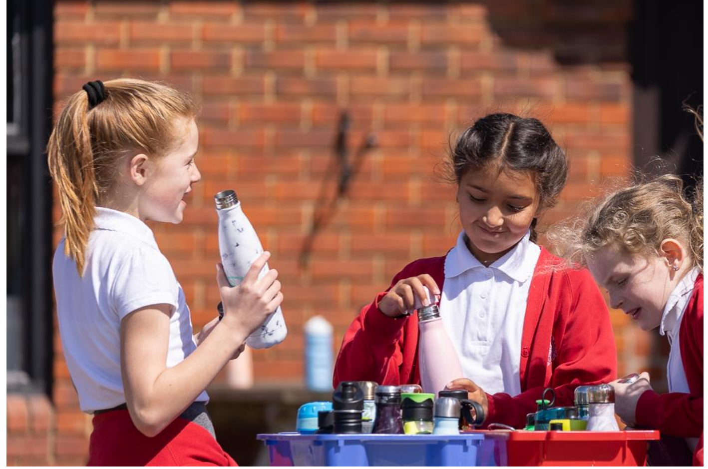
SCHOOL PROSPECTUS 2023-24