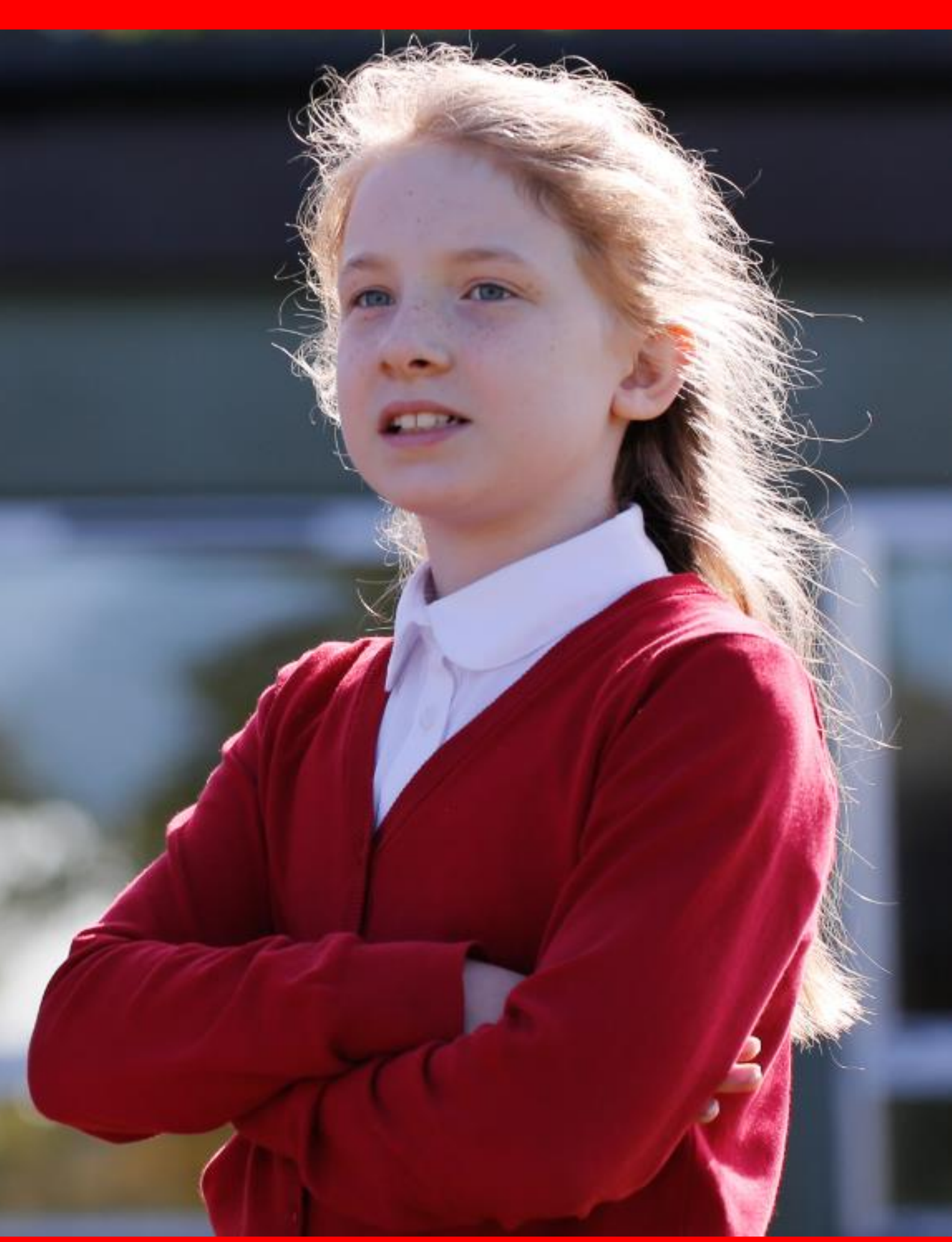
Debden Primary Academy