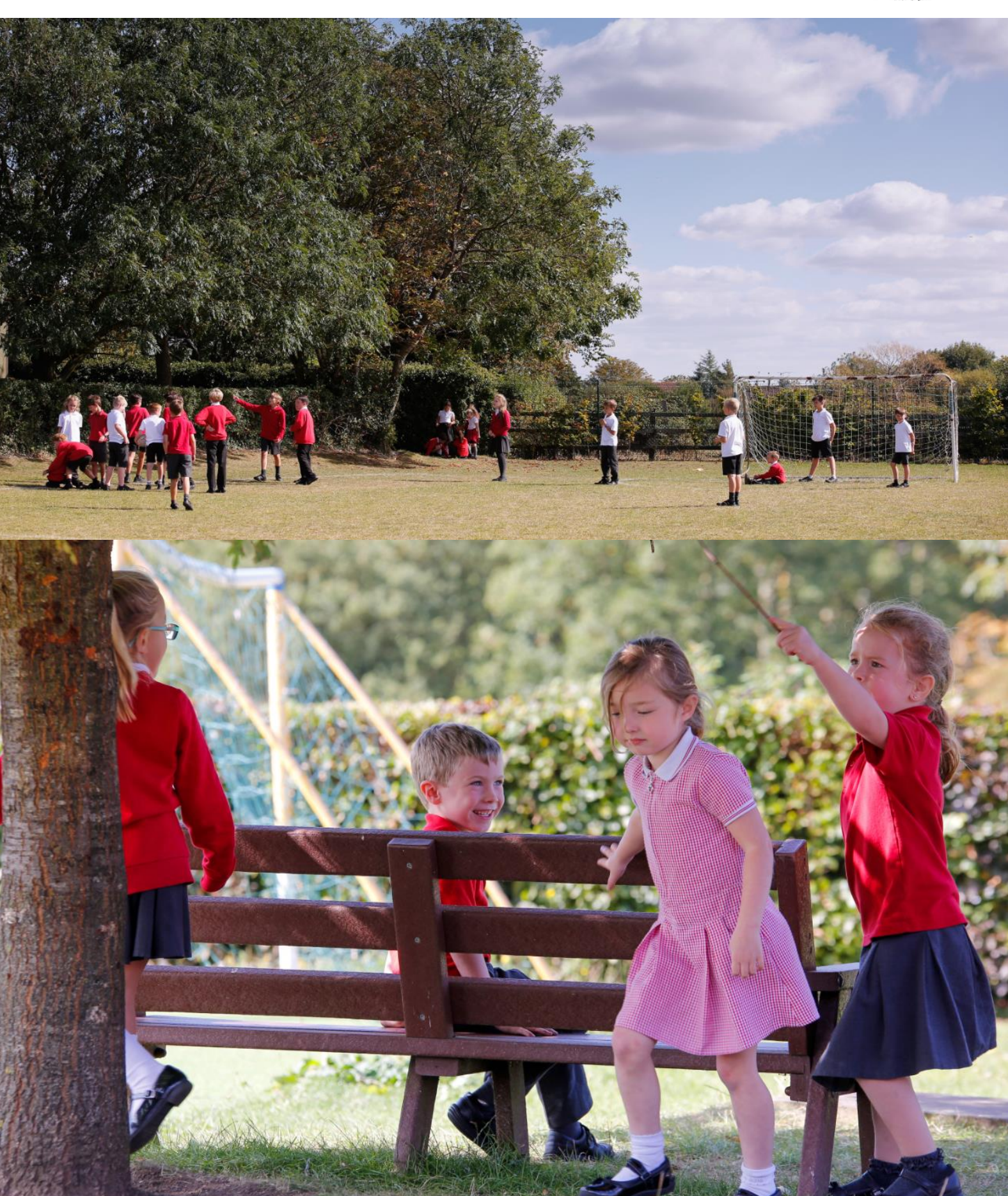
SCHOOL PROSPECTUS 2023-24