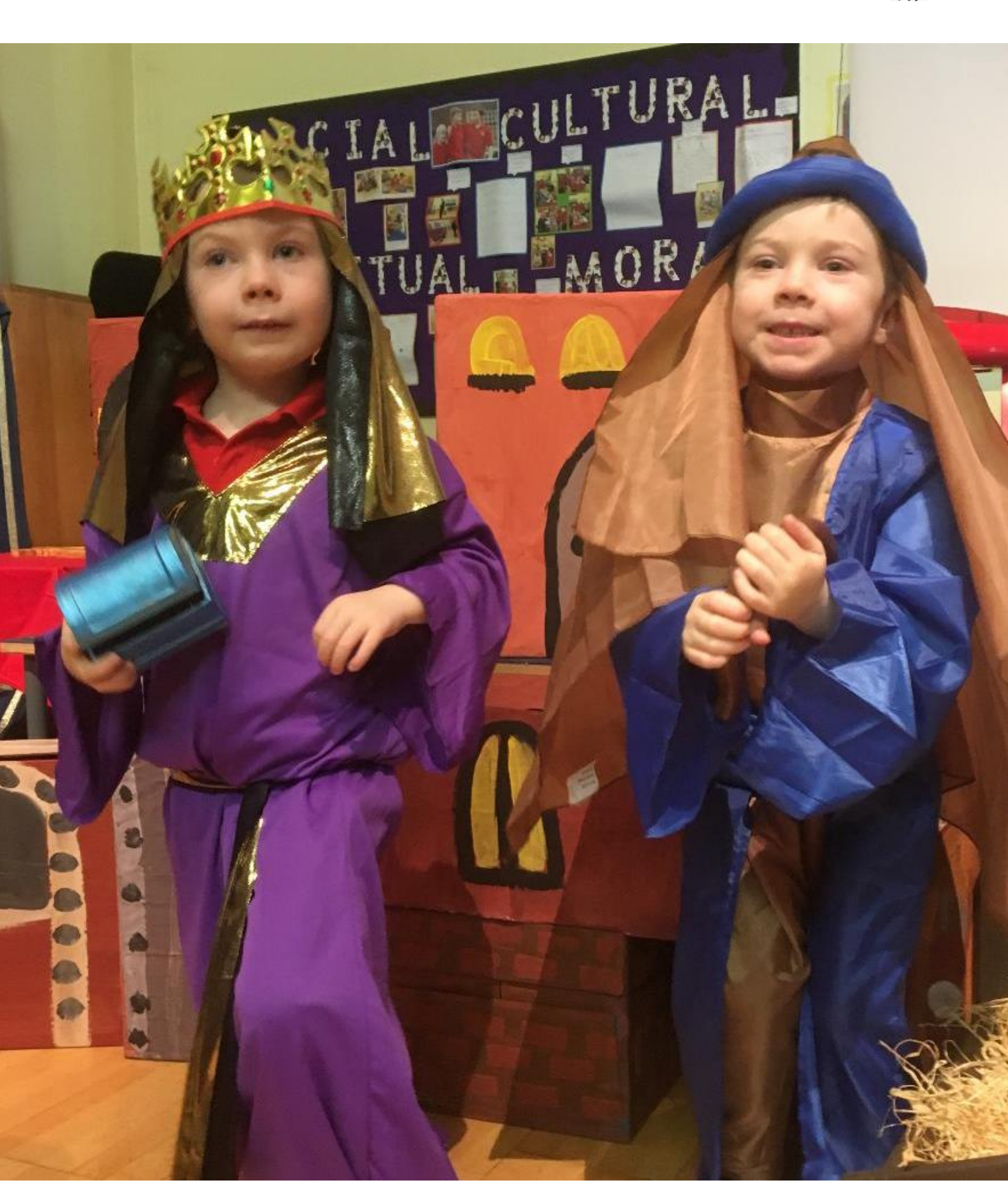
SCHOOL PROSPECTUS 2023-24