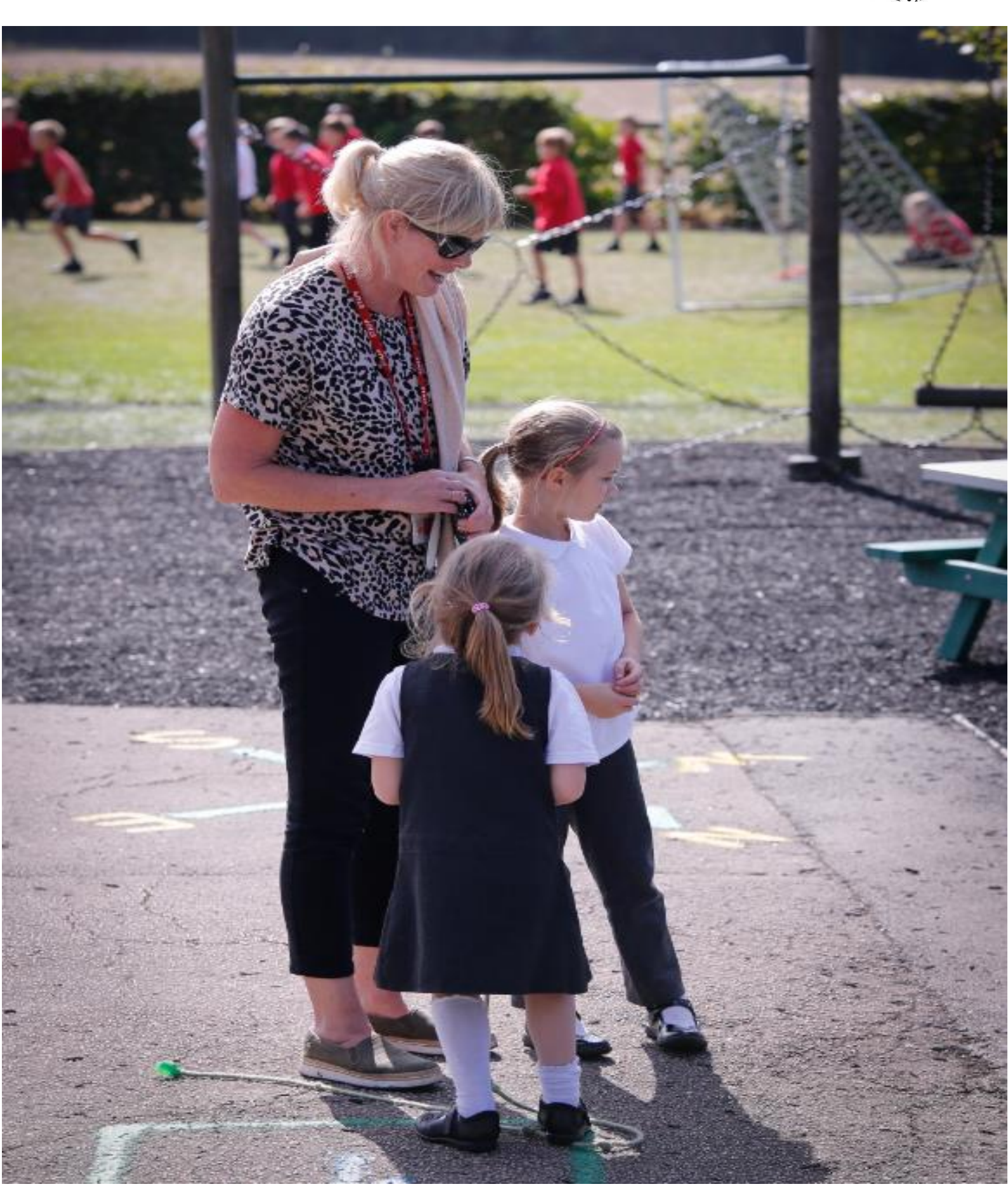
SCHOOL PROSPECTUS 2023-24