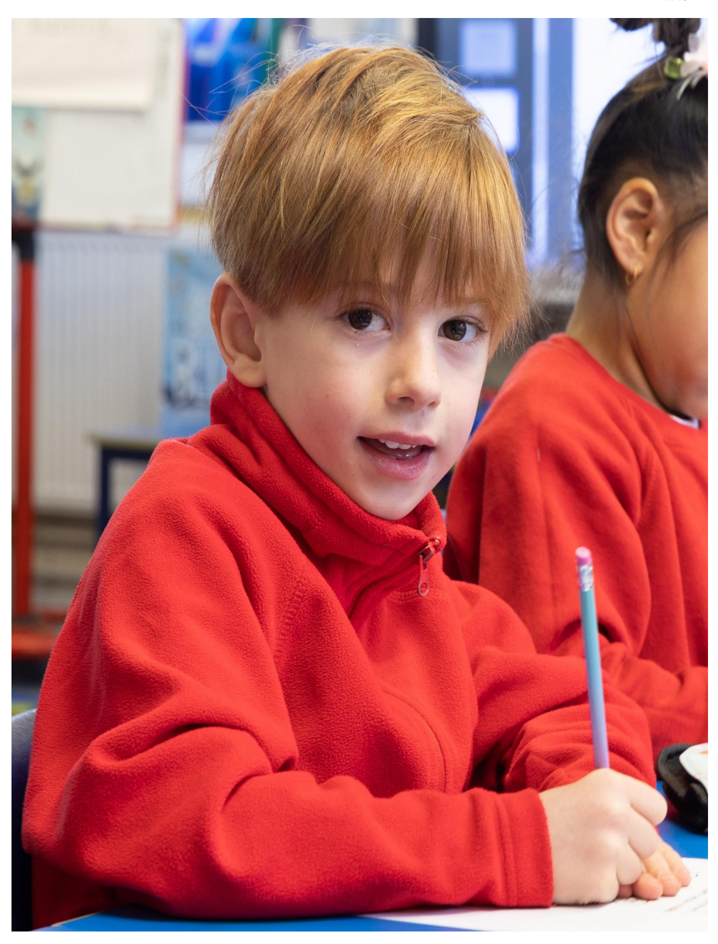
SCHOOL PROSPECTUS 2023-24