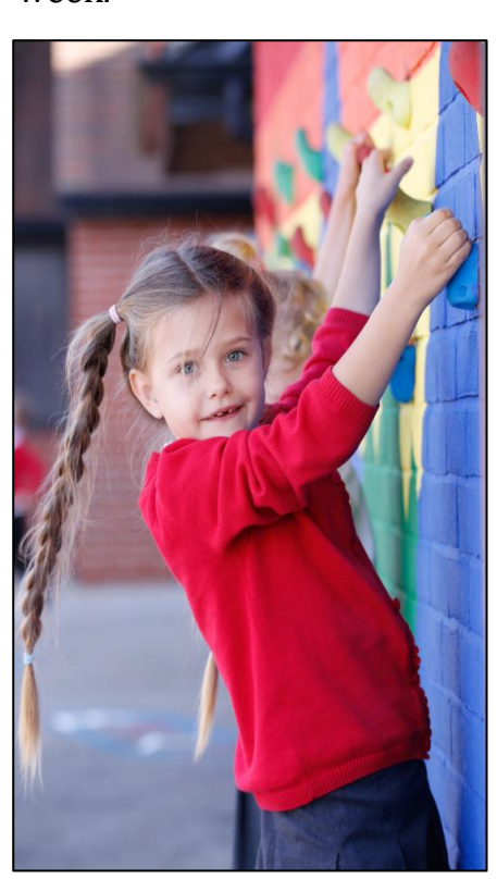
SCHOOL PROSPECTUS 2023-24

The winning house at the end of each half term is granted a special treat – this usually takes the form of a 'fun hour' or a 'movie afternoon.' A house points update is given in achievement assembly each week.