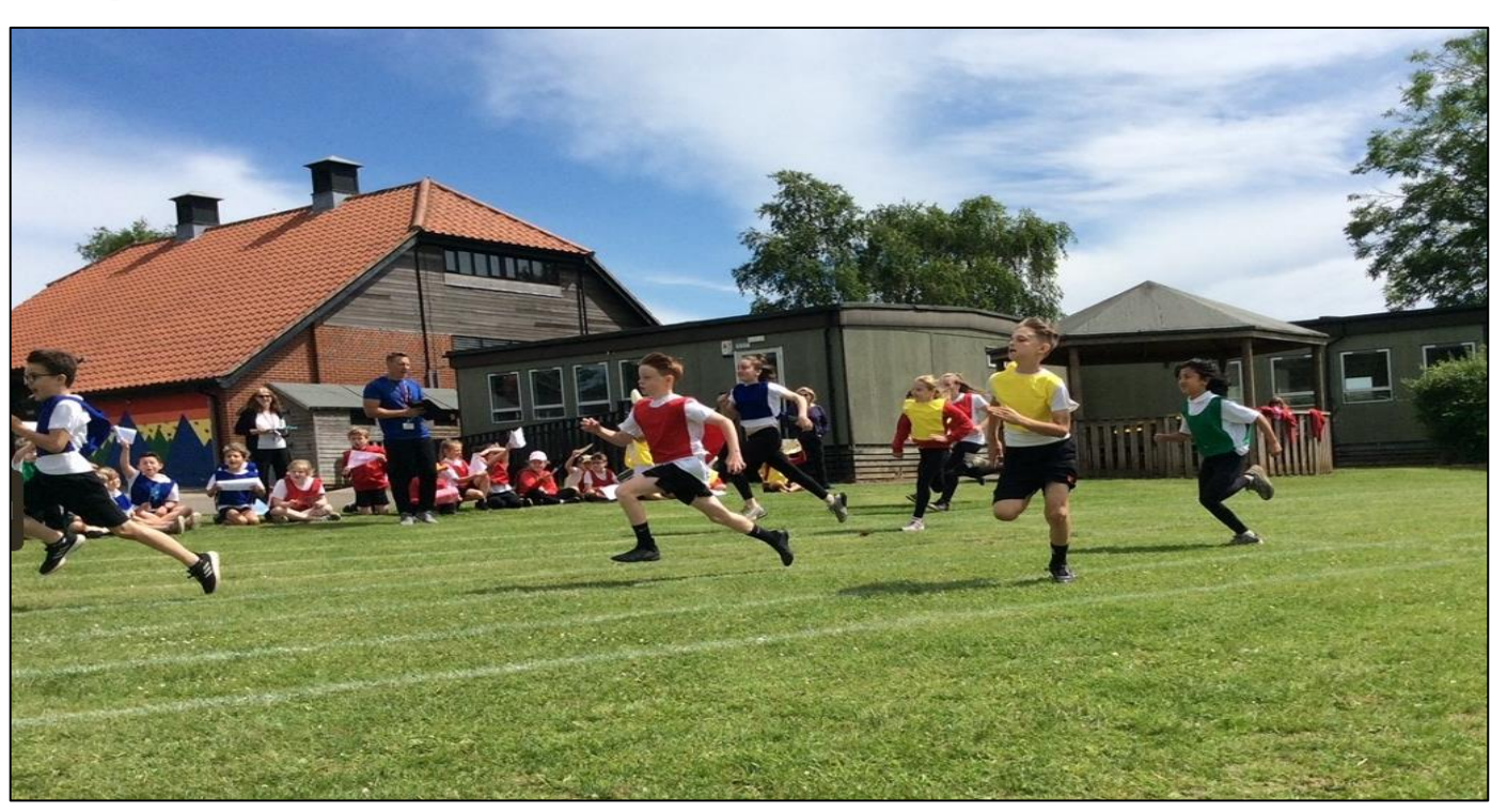
SCHOOL PROSPECTUS 2023-24

The extra curriculum clubs and our breakfast club offer a range of sports activities before and after school.