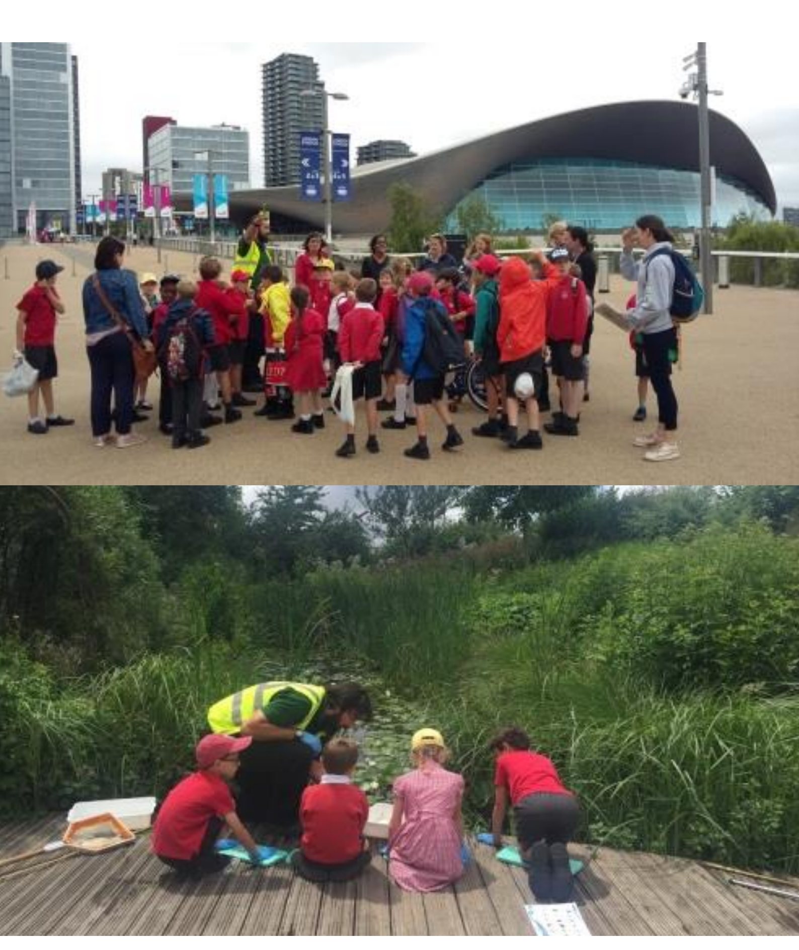
SCHOOL PROSPECTUS 2023-24