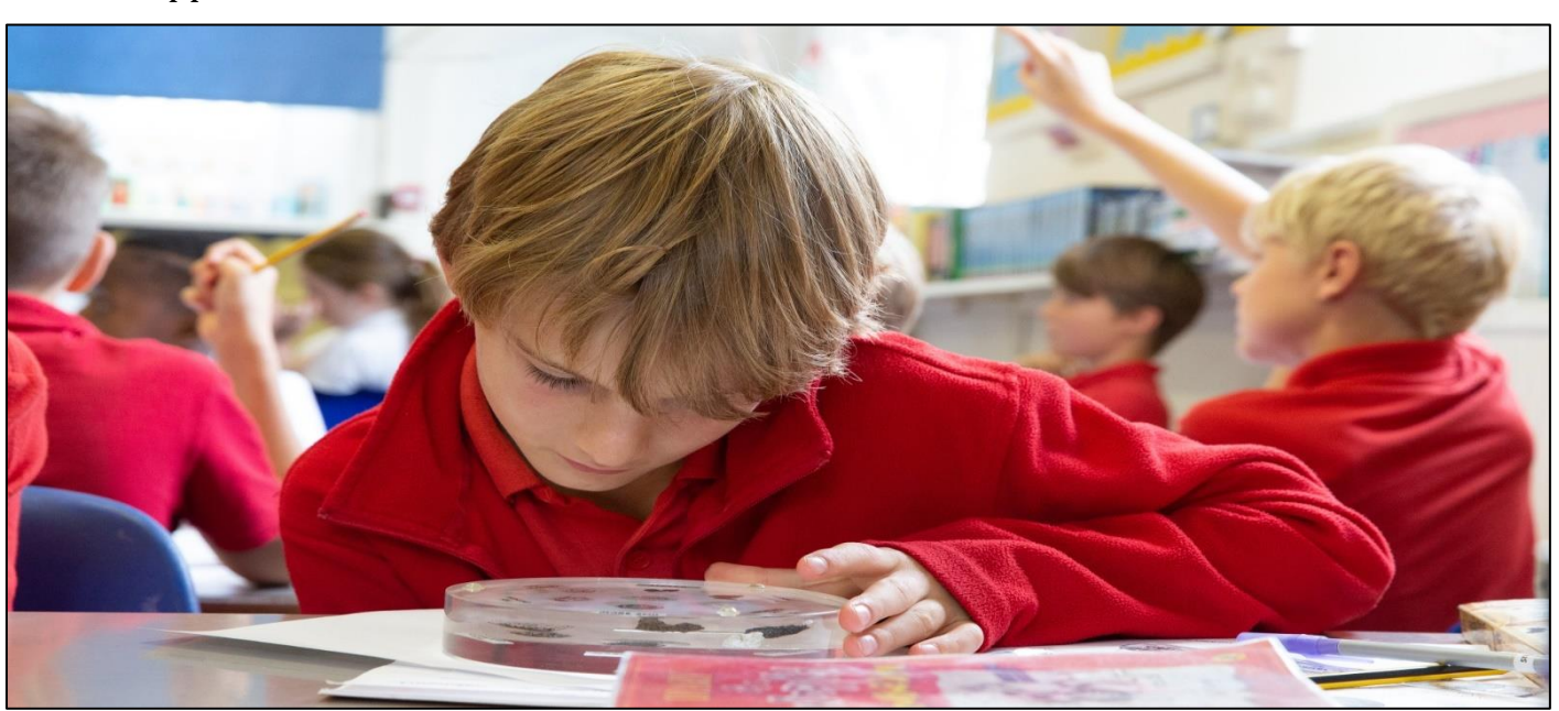
SCHOOL PROSPECTUS 2023-24