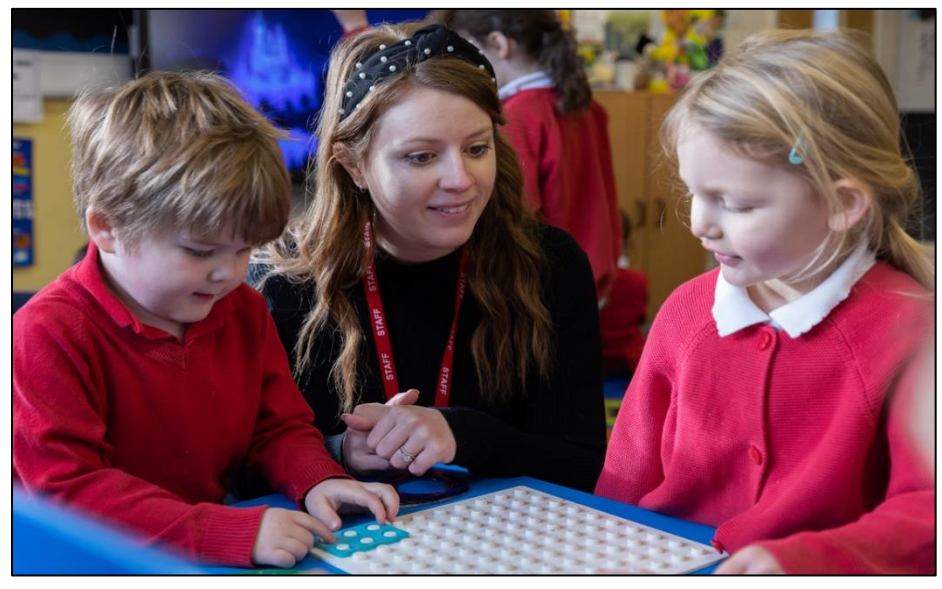
SCHOOL PROSPECTUS 2023-24

We use a secure online learning journal to share photographs of what your child has been learning at school with you at home.